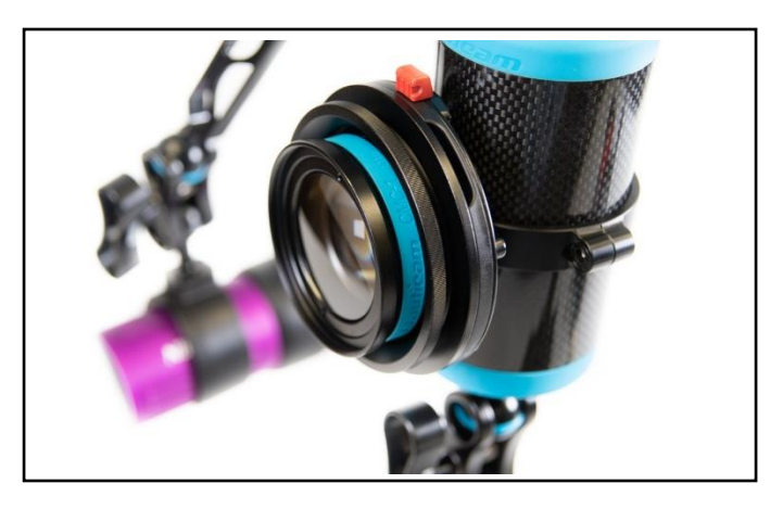
Example: SMC with bayonet adaptor on the bayonet holder

Align the bayonet holder by the two screws holes, and secure them by tightening the 2x screws.